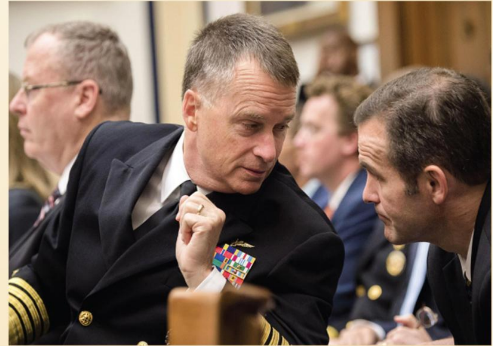
Ask for Help