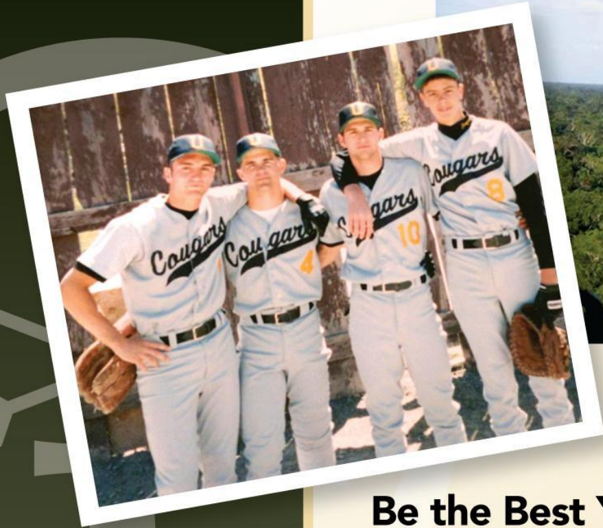
Be the Best You