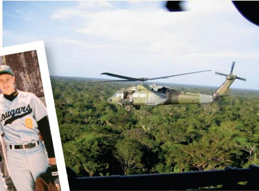
Believe in Yourself